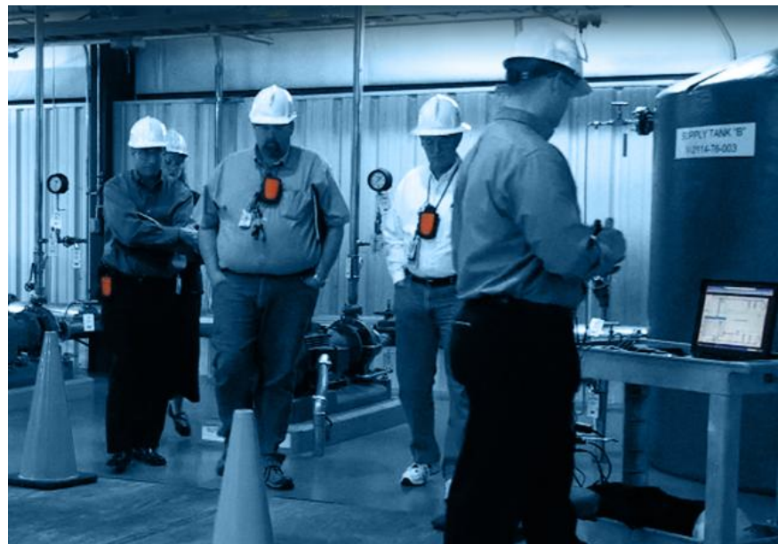
Q-Track’s Radiation Worker Training System brings “Practice-As-You-Play” realism to nuclear training.

Enhanced Worker Efficiency: The overall impact of the Q-Track Radiation Worker Training System is improved efficiency which translates directly to the bottom line.